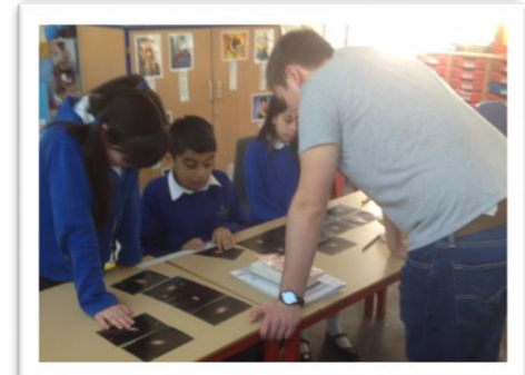
Above - Our Year 6 pupils loved the Inflativerse and learned so much about the night sky.